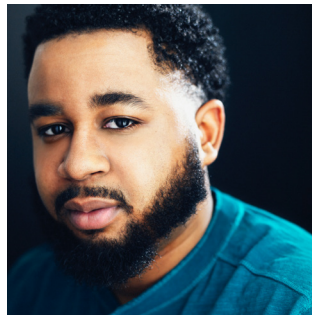
DYLAN J. FLEMING SQUEAKERS

is the curious mouse who is playful and quickly bounces from one activity to another!